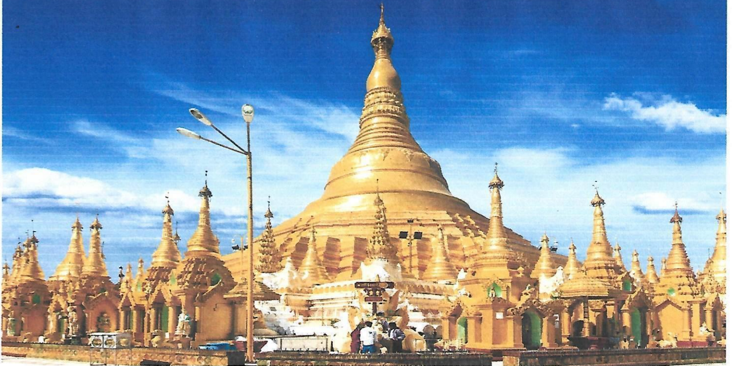
Shwedagon Pagoda, Yangon, Myanmar