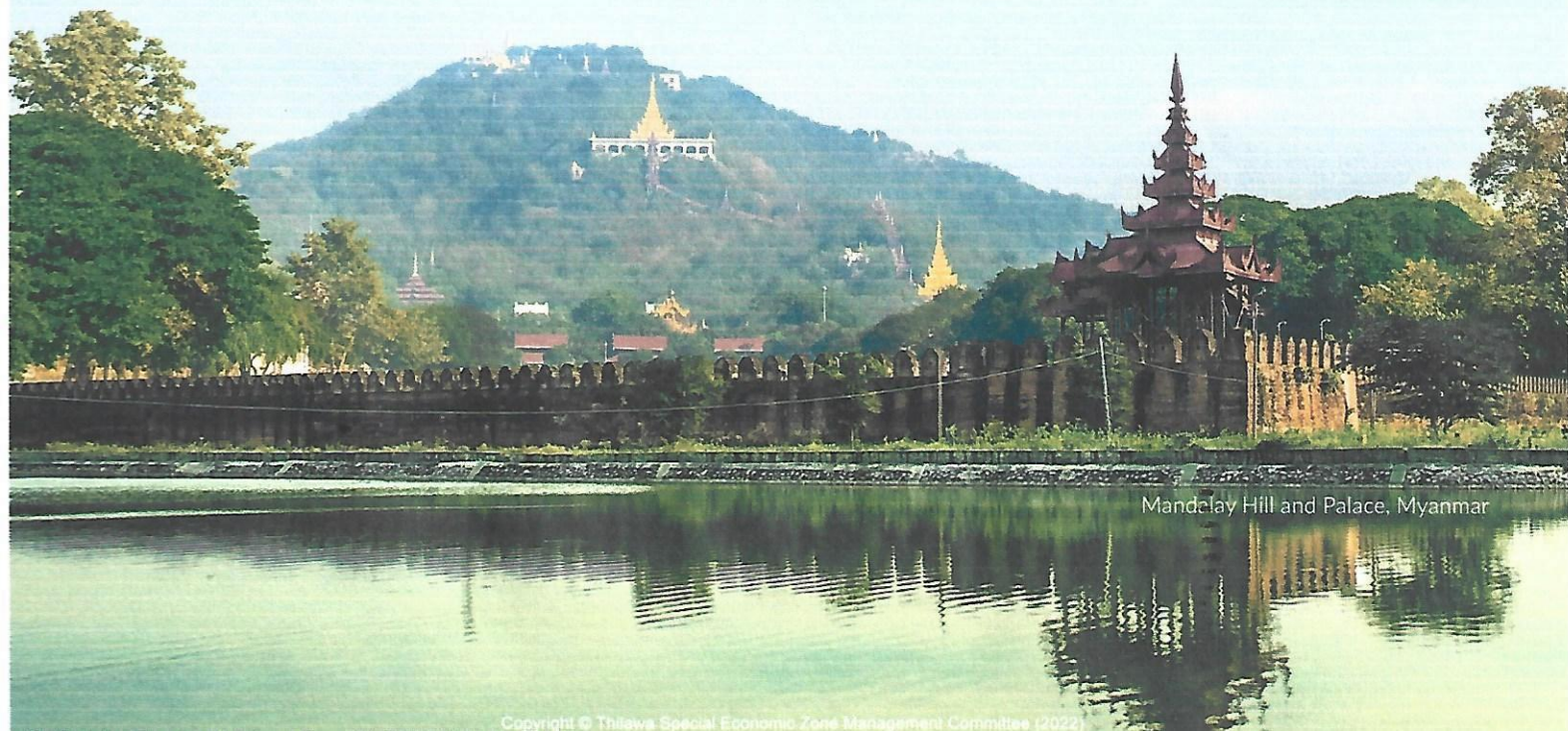
Mandalay Hill and Palace, Myanmar